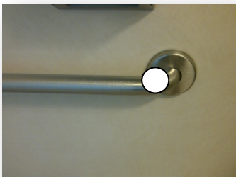
9. Handrails by toilet – At curve where rail goes towards the wall