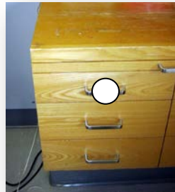
2. Bedside table handle – On handle or if no handle, place on drawer face