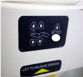
1. Bed adjustment controls – External side beside buttons