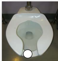
10. Toilet seat – On front aspect of porcelain surface