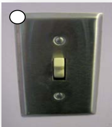
4. and 8. Bedside/bathroom light switch UVM on one of four corners of plate