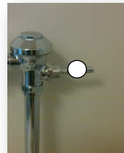
11. Toilet flusher – Top of handle 2/3 away from edge