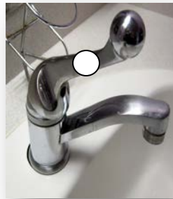
5. and 6. Sink faucet handles – On the side of a handle