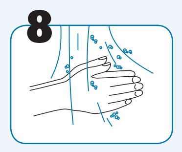
Rinse thoroughly under running water.