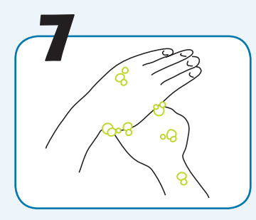
Rub each thumb clasped in opposite hand.