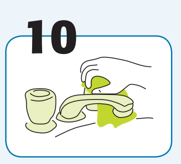
Turn off water using paper towel.