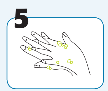
Rub back of each hand with palm of other hand.