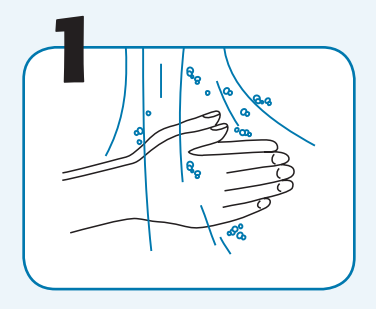
Wet hands with warm water.