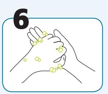
Rub fingertips of each hand in opposite palm.