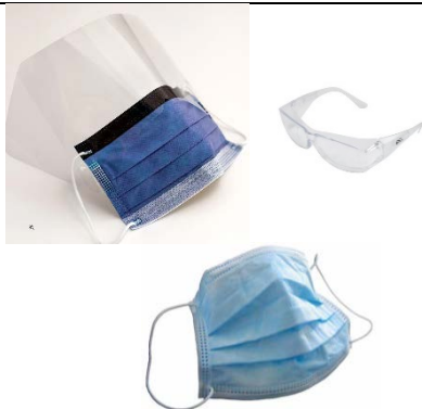
PROCEDURE MASK & EYE PROTECTION should be used:

To ensure availability of the appropriate masks when required, the table below outlines the indications for procedure masks and N95 respirators. All staff should use the specific mask as indicated below, based on the infection control precaution needs of the patient.