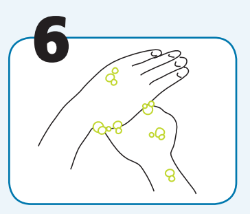
Rub each thumb clasped in opposite hand.