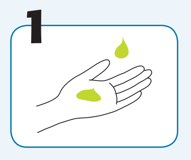
Apply 1 to 2 pumps of product to palms of dry hands.