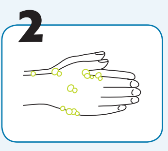
Rub hands together, palm to palm.